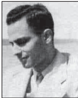
HARISH CHANDRA (1923-1983)