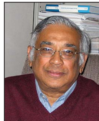
S.R.S. VARADHAN (1940)