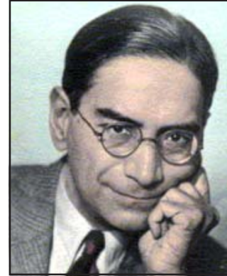
PRASANTA CHANDRA MAHALANOBIS (1893-1972)