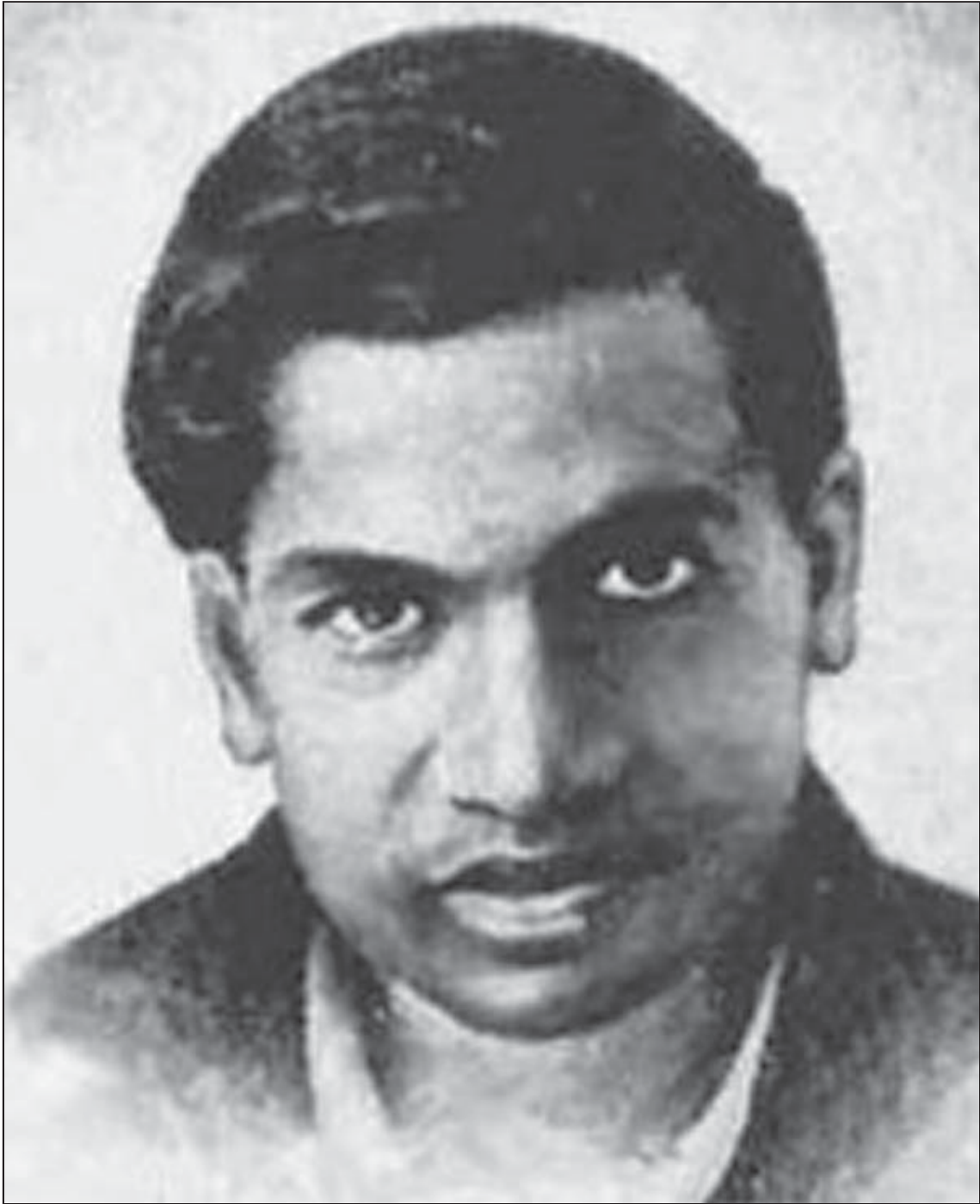
SRINIVASA RAMANUJAN (1887-1920)